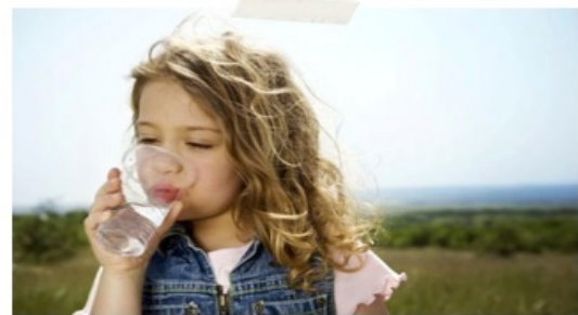
tā hē shuǐ 她喝水。